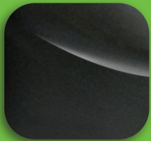
High Gloss Black