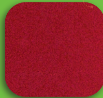
Candy Apple Red